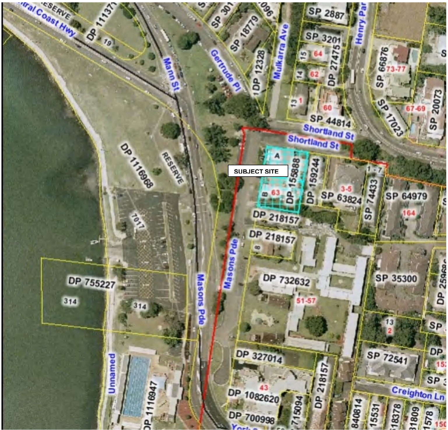
Figure 3 - Aerial Photograph showing location of subject site