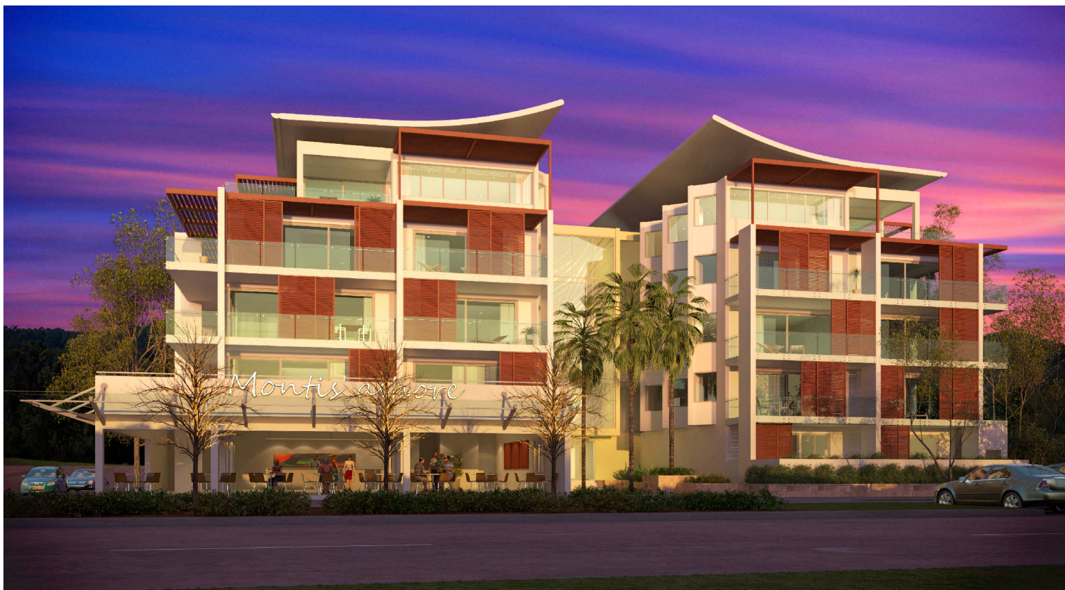
Figure 1: Architect's drawing of proposed development